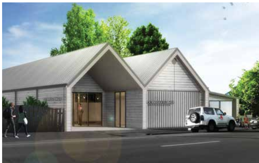
ARTISTS IMPRESSION OF THE NEW ENTRANCE BUILDING FOR COBBLESTONES MUSEUM ON MAIN ST IN GREYTOWN, DUE FOR COMPLETION JUNE 2014. WWW.COBBLESTONESMUSEUM.ORG.NZ